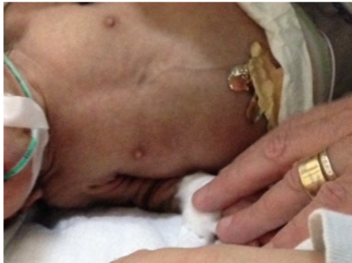
Figure 3. Prominent nipples are a typical finding in neonates with Donohue syndrome.