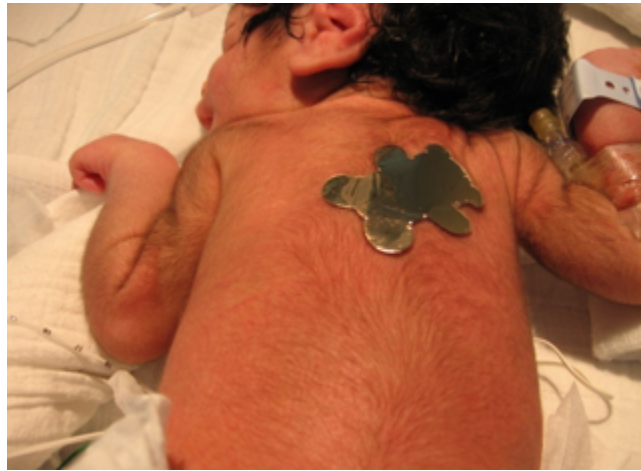
Figure 2. Hypertrichosis is a feature in all individuals with Donohue syndrome.

Reproduced from Falik Zaccai et al [2014]