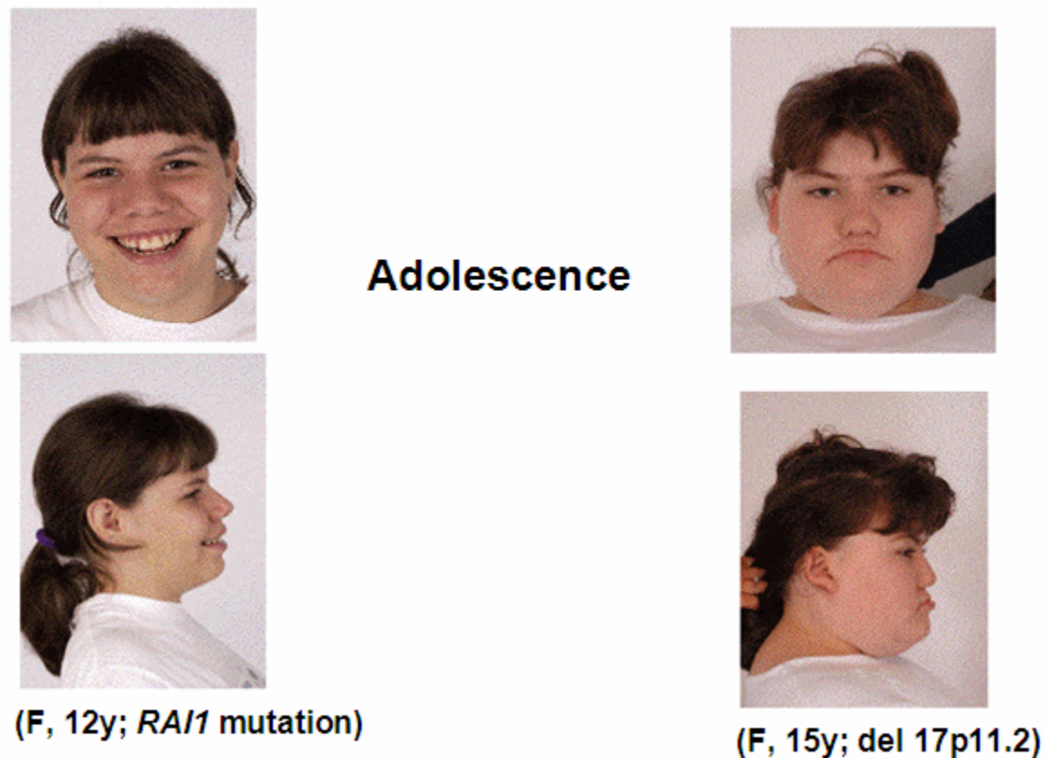
Figure 3. Adolescent females with SMS caused by mutation of RAI1 (left) and deletion 17p11.2 (right). Note short philtrum with relative prognathism resulting from midface retrusion that persists with age; downturned upper lip is more notable at rest (non-smiling).