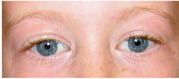
Figure 1. Note the stellate iris pattern in an individual with Williams syndrome