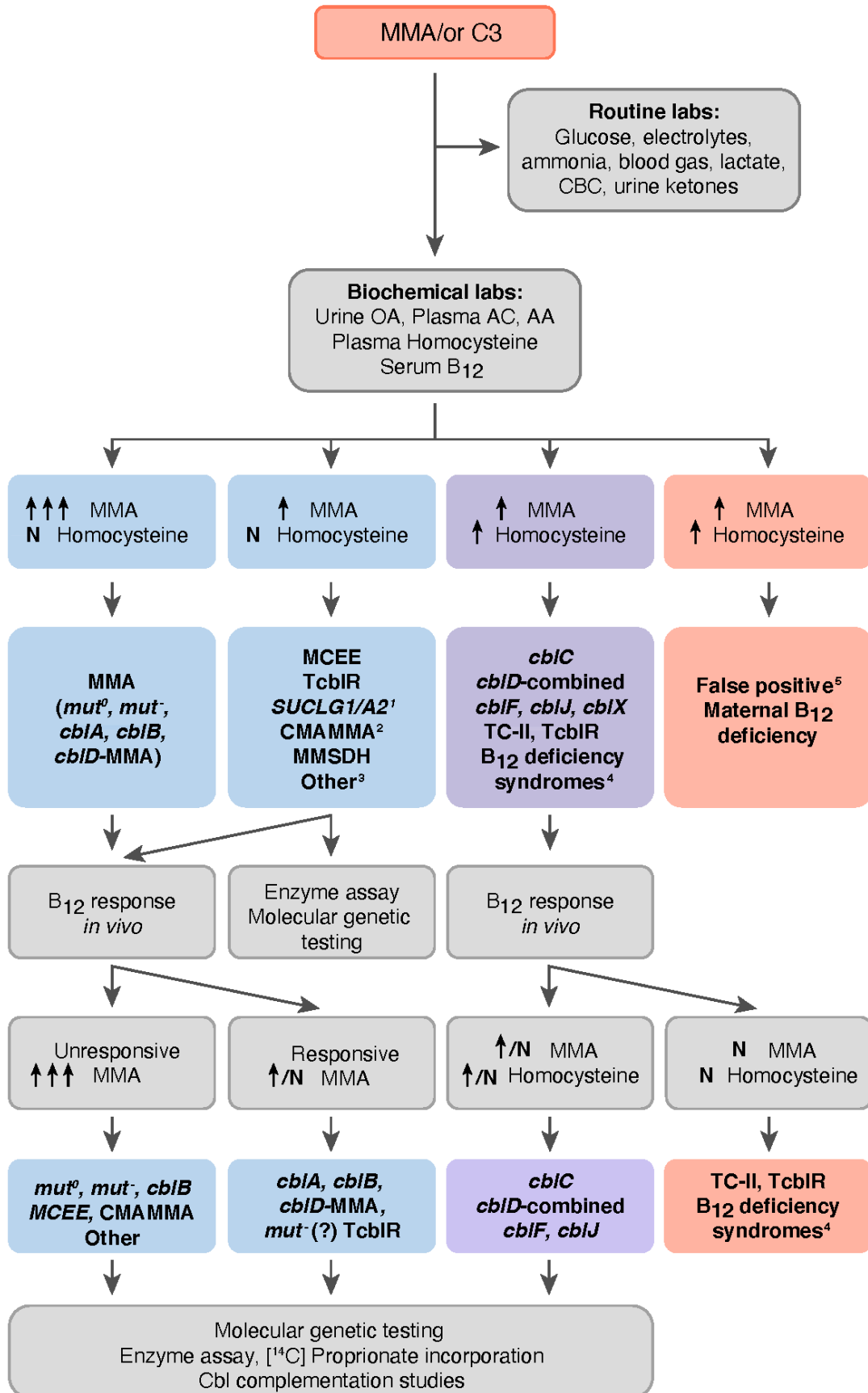
Figure 2. An algorithm of conditions to be considered in the differential diagnosis of elevated serum or urine methylmalonic acid