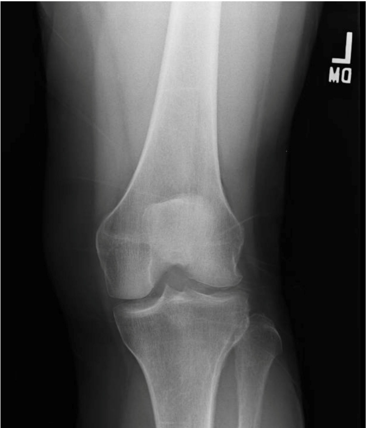
Figure 4. Radiograph of treated adult hypophosphatasia: linear sclerosis in remodeling distal femur and proximal tibia, osteophytes mid-proximal tibia, and chondrocalcinosis medial lateral compartment