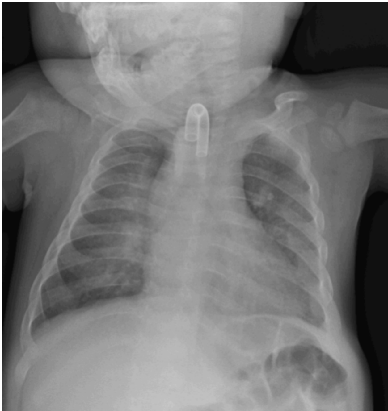
Figure 3. Radiograph of treated hypophosphatasia. Individual from Figure 2A after 12 months of asfotase alfa enzyme replacement therapy. Note tracheostomy tube, placed for laryngomalacia and bronchomalacia, features of the treated disease. Rachitic rib and metaphyseal changes have resolved. The two epiphyseal growth centers at the proximal humeri are normal.