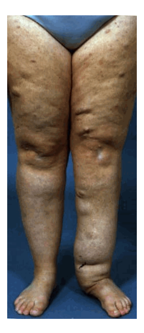
Figure 3. Plexiform neurofibroma

5. Negative NF1 molecular testing does not rule out a diagnosis of NF1 [Accetturo et al 2020]. Some individuals diagnosed with NF1 based on clinical criteria do not have a pathogenic variant detectable by current technology. Many clinical features of NF1 increase in frequency with age, and some individuals who have unequivocal NF1 as adults cannot be diagnosed in early childhood, before these features become apparent.