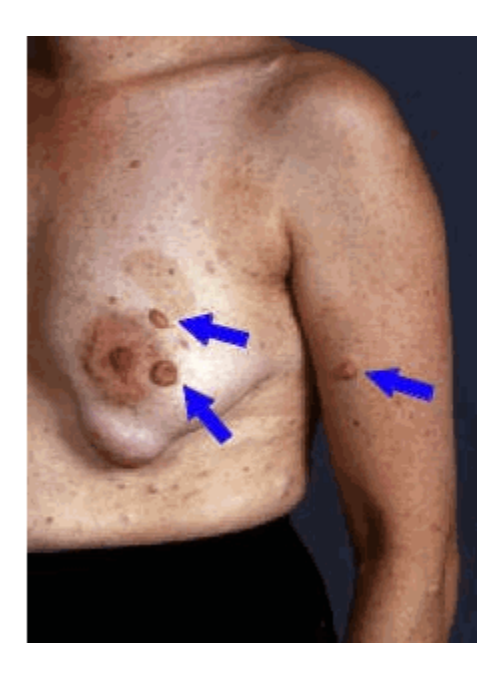
Figure 2. Neurofibromas